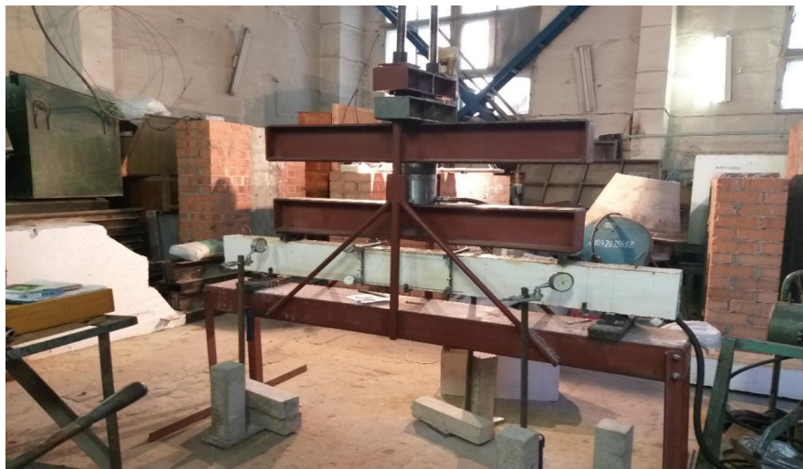
Fig. 2. Power plant

To test the beams, special power plants were designed, manufactured and certified (Fig. 2). The load was applied according to a four-point scheme using a hydraulic jack DG-50 and a distribution beam-traverse in two concentrated forces in steps: (0.04 ... 0.06) F_{ult} before the appearance of the first normal and inclined cracks, then – by (0.08 ... 0.12) F_{ult} to excessive opening of these cracks and again on (0.04 ... 0.05) F_{ult} up to destruction. The load endurance on the step was up to 15 minutes with all measurements at the beginning and end of each load step.