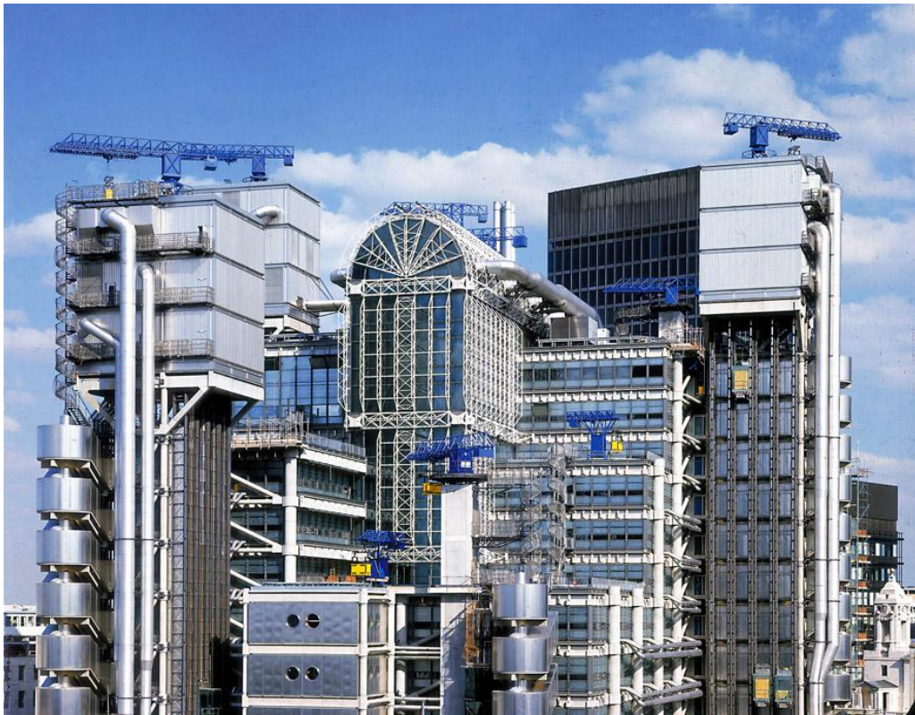
Fig. 5. The building of the insurance company "Lloyd" in London, 1987, architect. R. Rogers