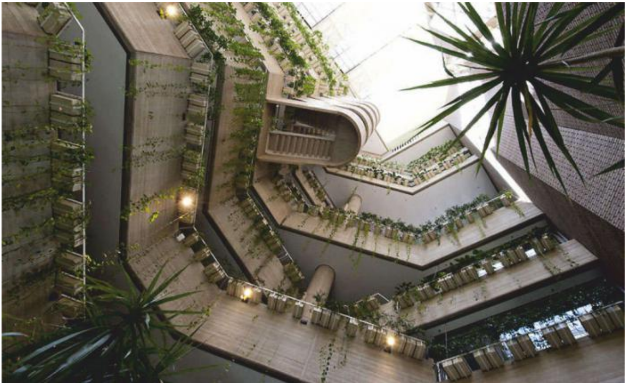
Fig. 1. Atrium in the office building of "Scandinavian Airlines" 1987, Stockholm, architect. N. Thorp

Foster there is an open-type atrium, i.e., illuminated from both sides, it is located at the level of the 10 lower floors (Fig. 5, Fig. 6).