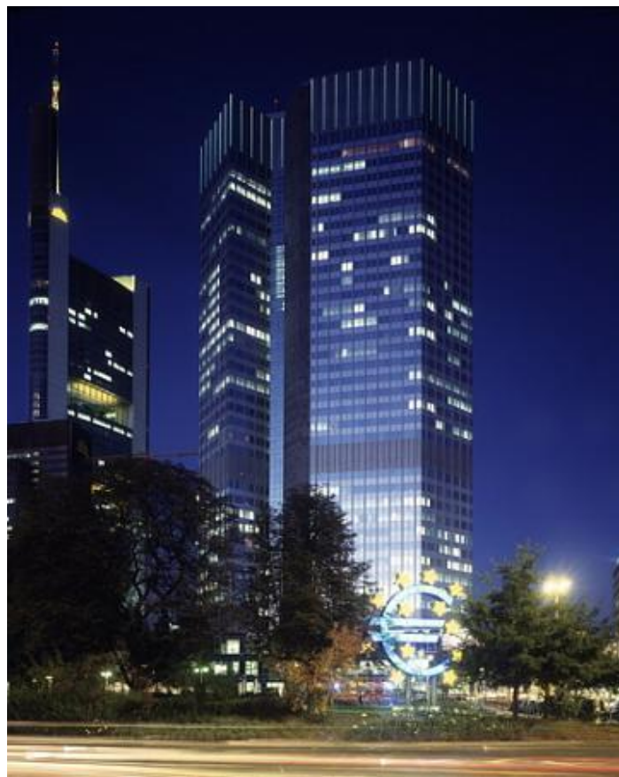
Fig. 2. European Central Bank building project 2010, Frankfurt am Main, arch. Bureau "Koop Himmelblau"