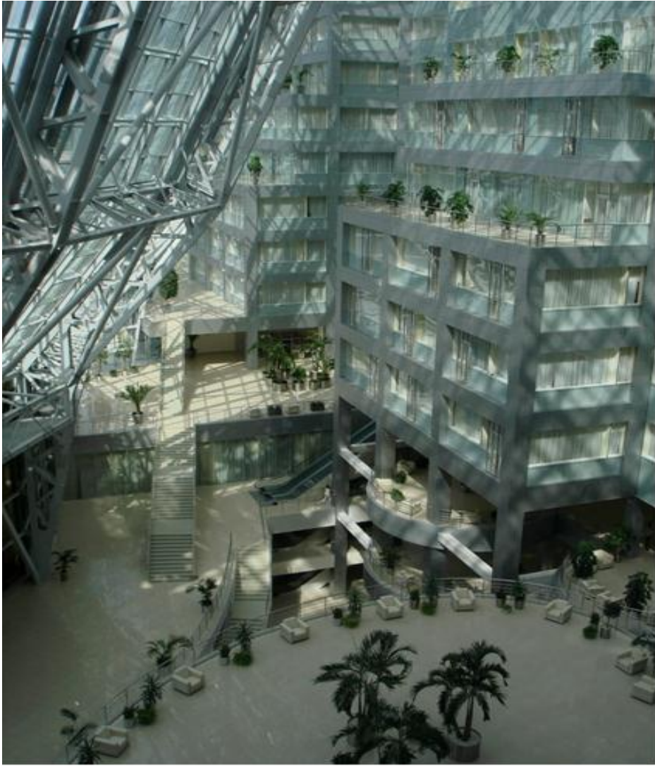
Fig. 3. Atrium in the building of the Administrative and Public Center, 2008, architect. M. Khazanov